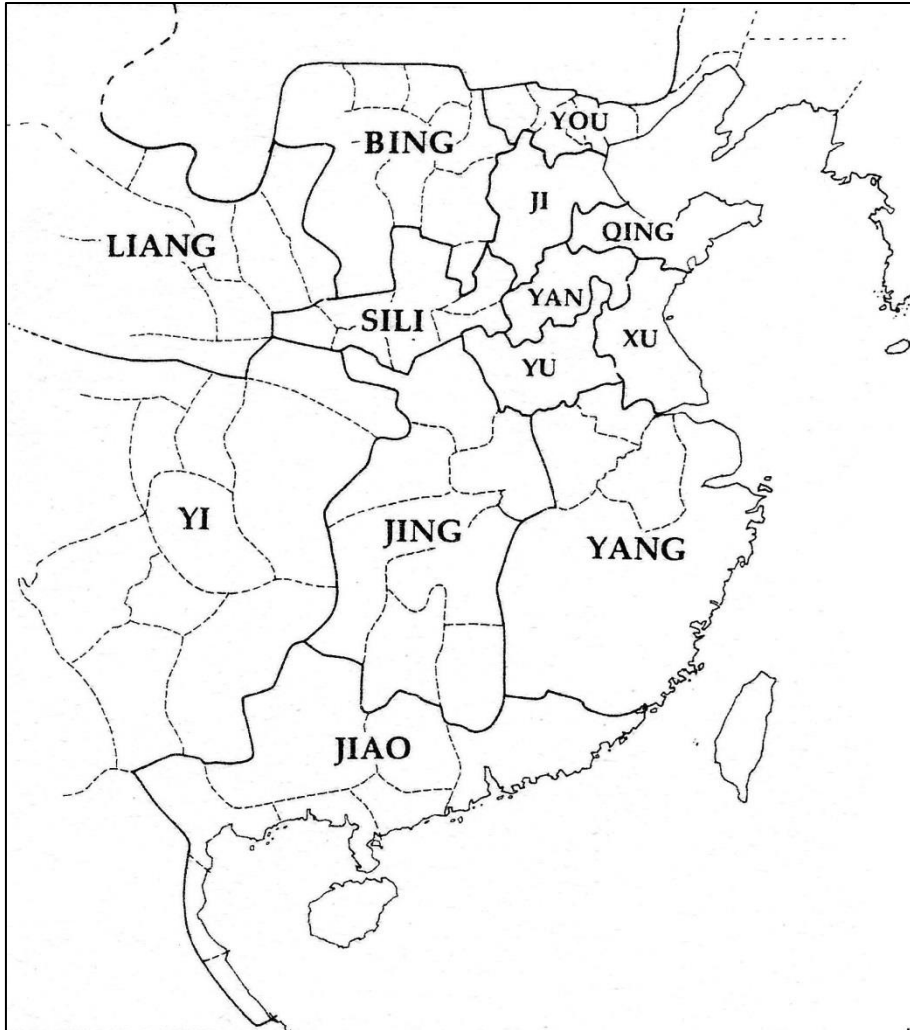
The provincial units of Later Han in 157